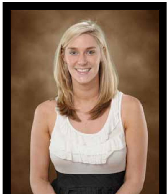
Green Screen Dropout